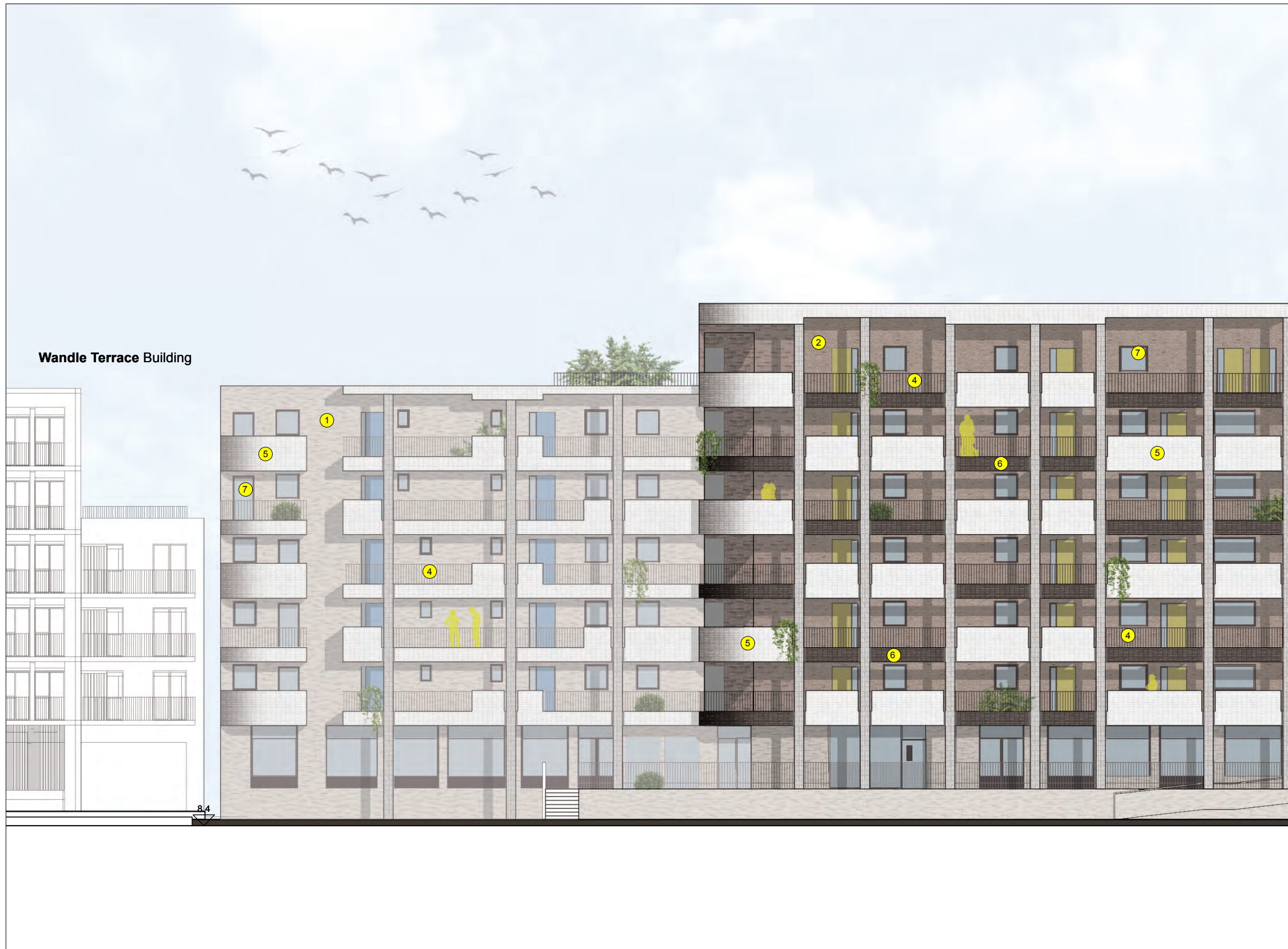
Wandle Terrace Building